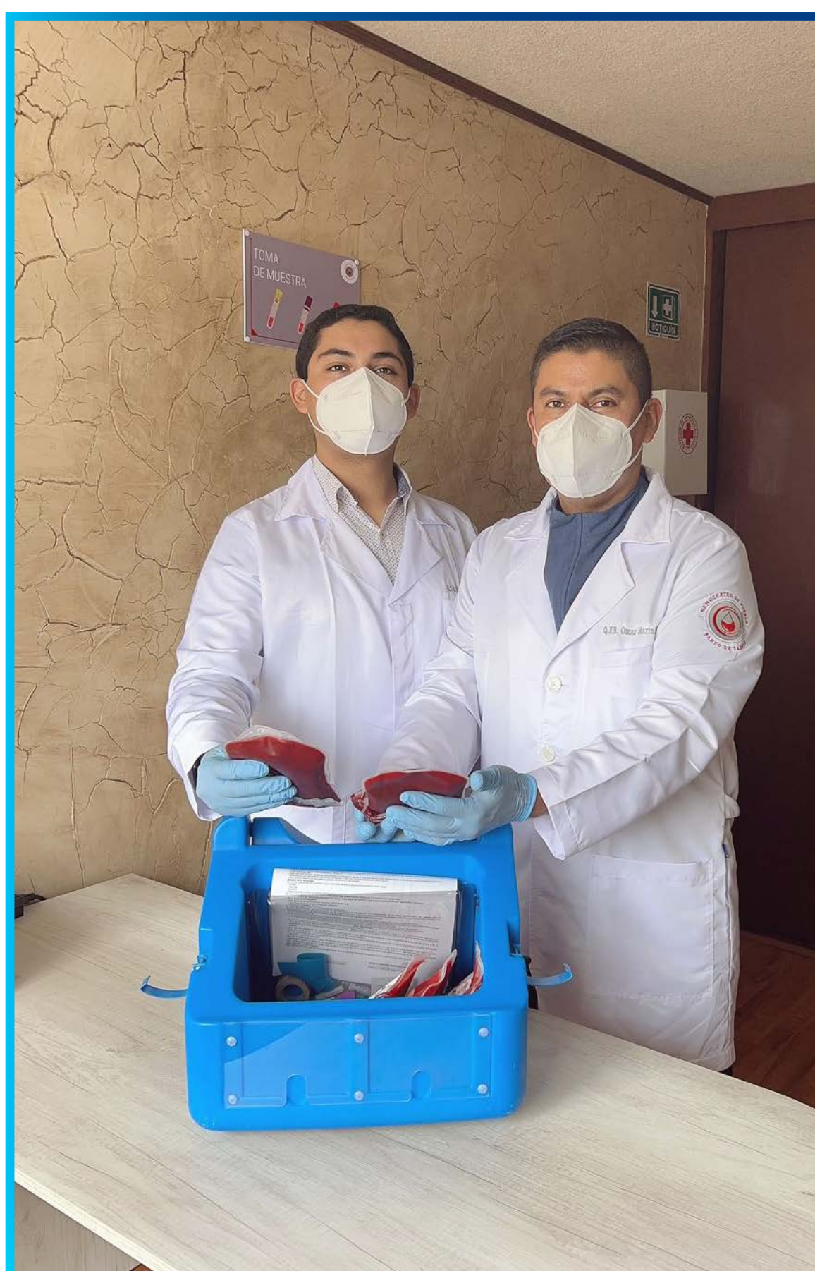
fig. Model MT4