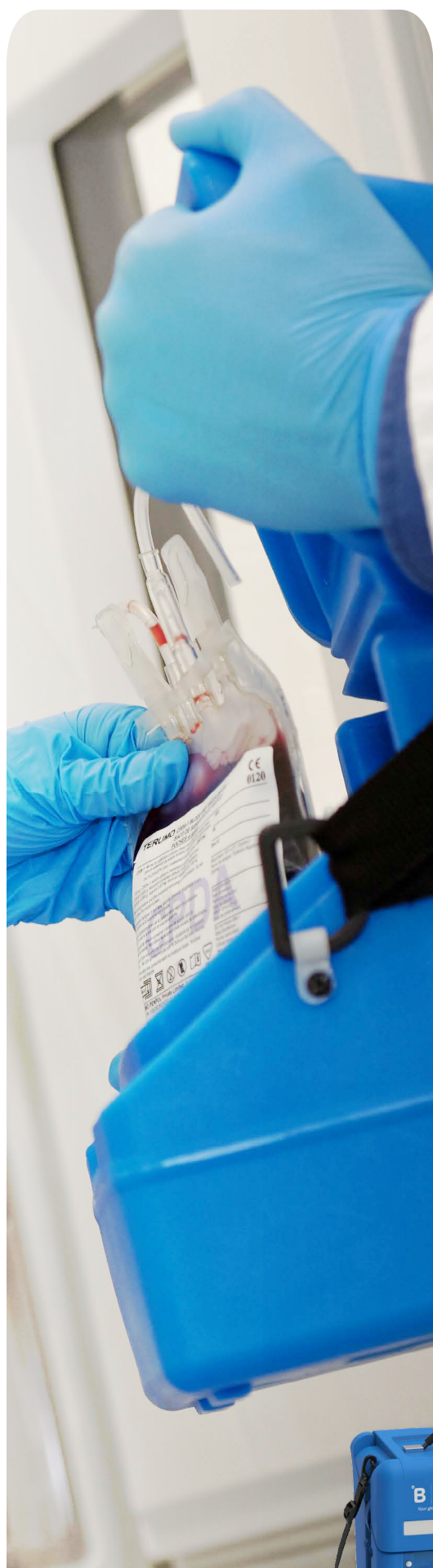
Blood Transport Boxes