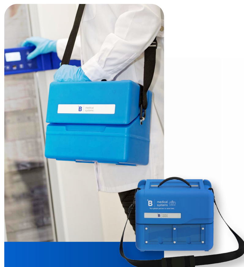
Blood Transport Boxes

C. Which products did you buy from B Medical Systems? I have a B Medical Systems MT4 blood transport box and it is used for transferring blood units to hospital transfusion services.