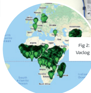
Fig 2: Vaclog