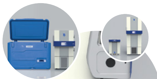
Fig 1: RTMD connected to U line